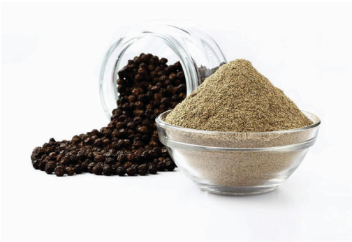
PEPPER POWDER 250 GRAMS