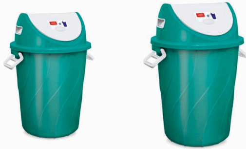
BIG DUSTBINS 02