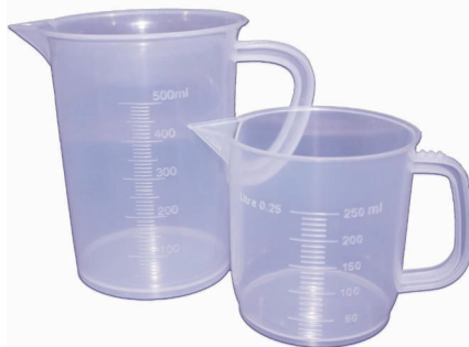
MEASUREMENT MUGS 02