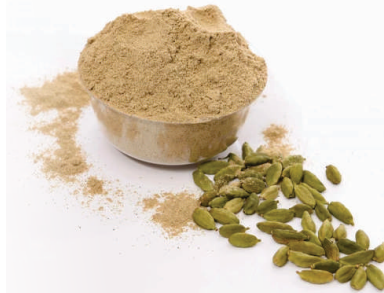
ELACHI POWDER 250 GRAMS