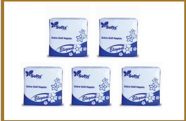
TISSUES 5 PACKETS