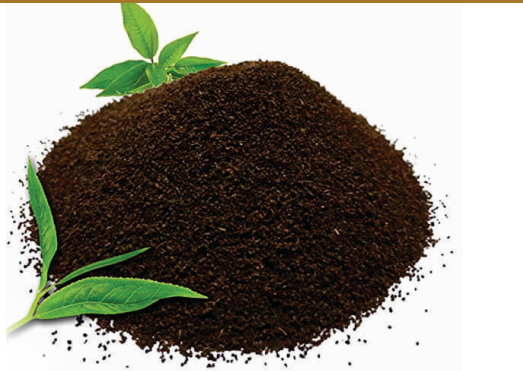
TEA POWDER 20 KG