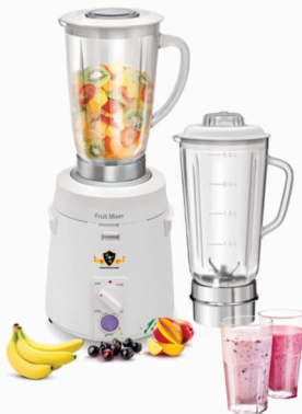
FRUIT MIXER 01