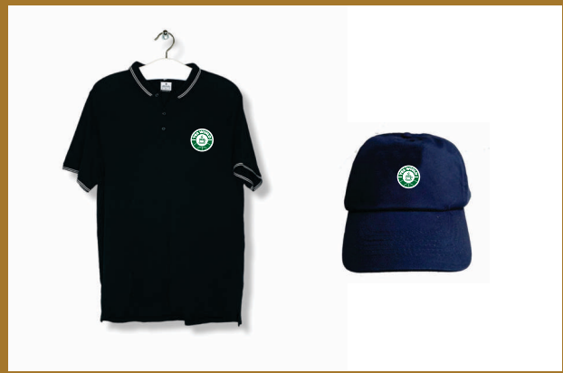
T-SHIRTS 04 & CAPS 02