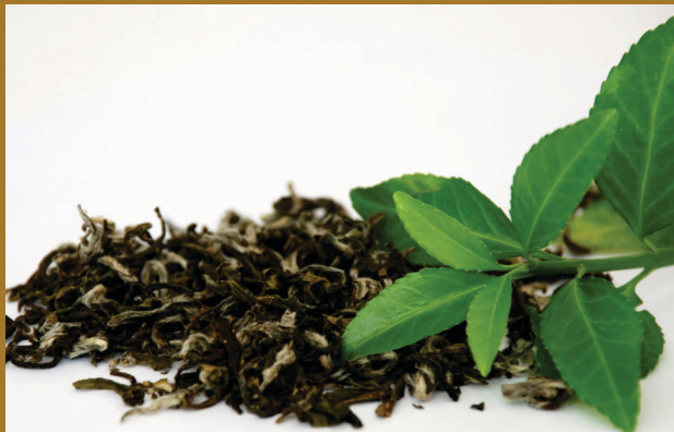
GREEN TEA LEAVES 01 KG