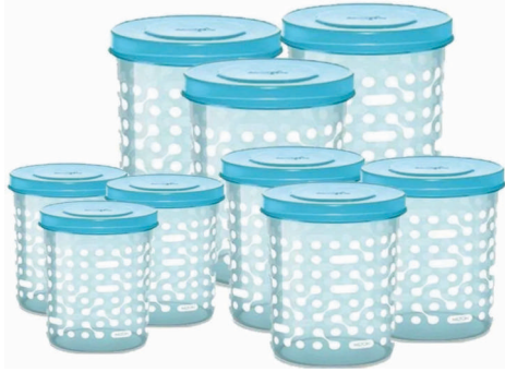
PVC STORAGE CONTAINER 10