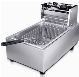
DEEP FRYER 01