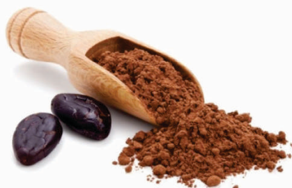
CHOCOLATE POWDER 500 GRAMS