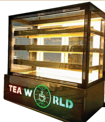
SNACKS DISPLAY HOT CASE 01