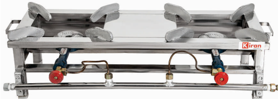
HIGH PRESSURE GAS STOVE 01