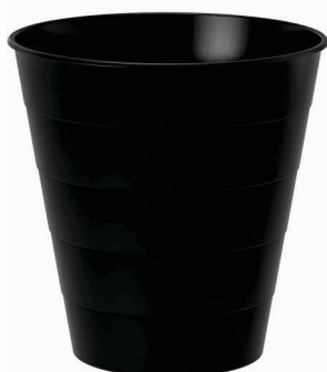
SMALL DUST BIN 01