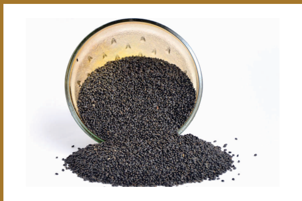
SABJA 250 GRAMS