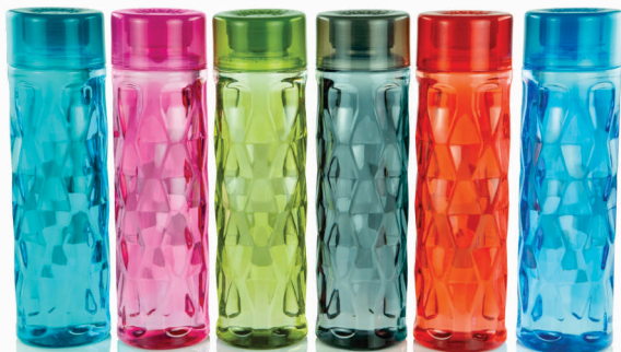
WATER BOTTLES 06