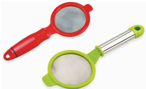
SMALL TEA FILTERS 01