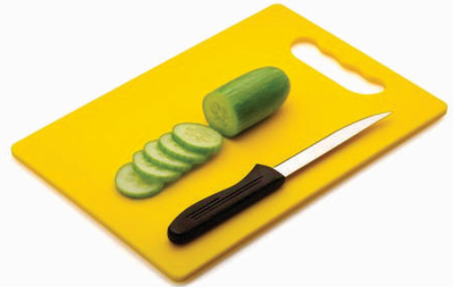
CHOPPING BOARD 01