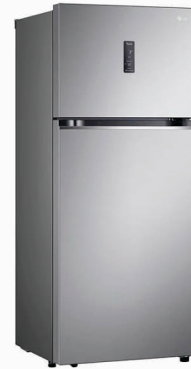
REFRIGERATOR 01 (DOUBLE DOOR)