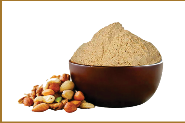
DRY FRUIT POWDER