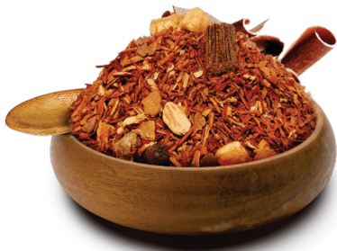
TEA MASALA 250 GRAMS