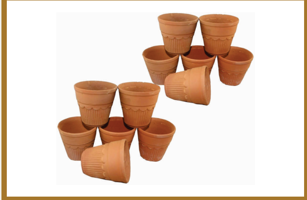
KULLAD TEA CUPS 200