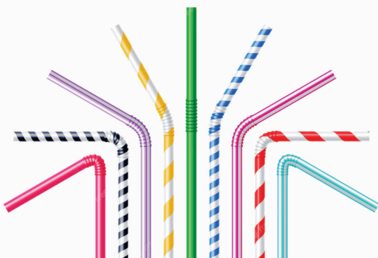
STRAWS 05 PACKETS