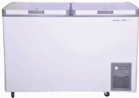
FREEZER 01 (DOUBLE DOOR)