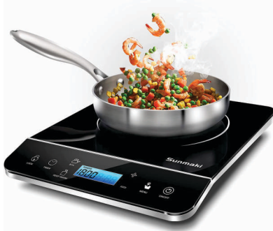
INDUCTION STOVE 01