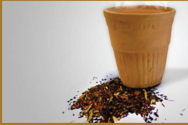
KULLAD TEA POWDER 250 GRAMS