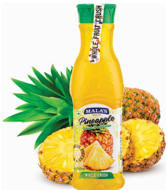
PINE APPLE CRUSH