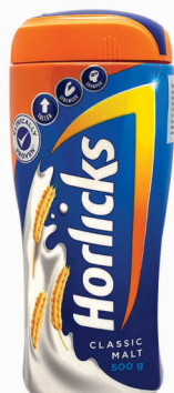
HORLICKS 500 GRAMS