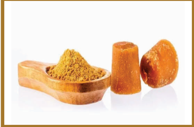
BELLAM POWDER 01 KG