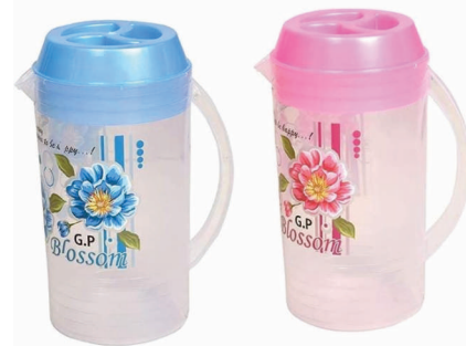
WATER MUGS 02