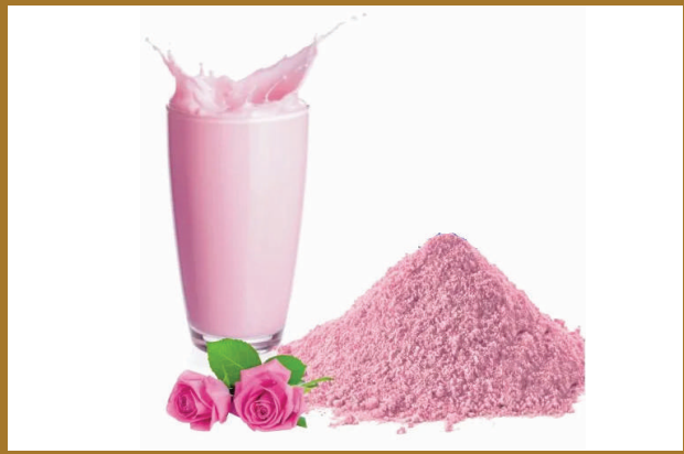
PINK TEA POWDER 01 KG