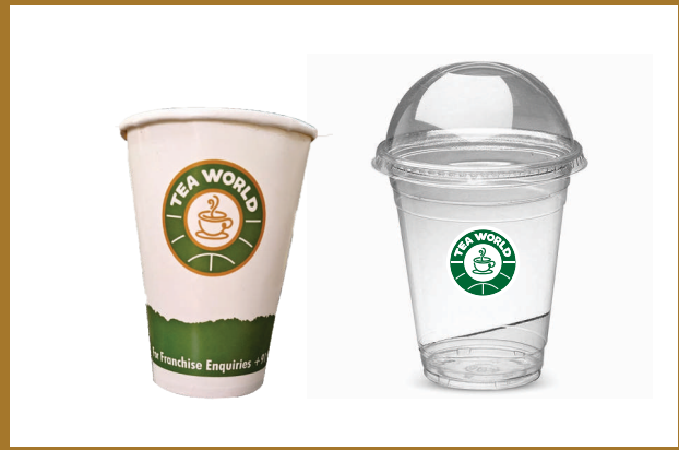
MILKSHAKE GLASS 500