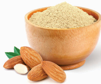
BADAM POWDER 01 KG