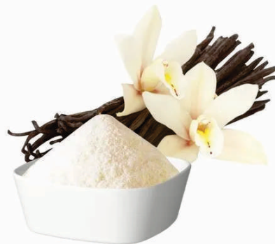
VANILLA POWDER 1 KG