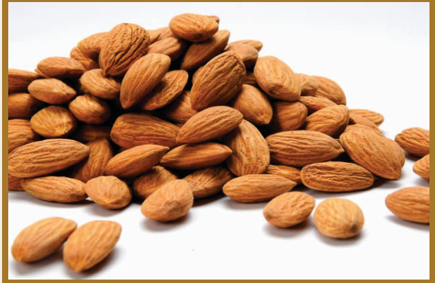
ALOMONDS 01 PACKET