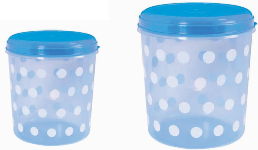
SUGAR TUBS 02