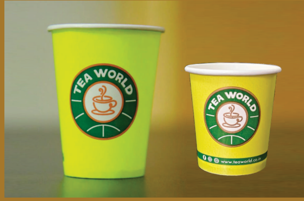
TEA CUP 5000 (90ML-2500, 80ML-2500)