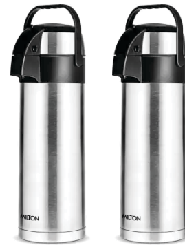
AIR TIGHT FLASKS 02