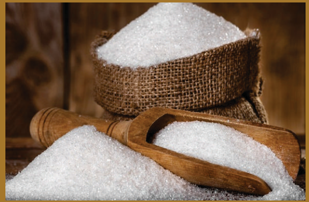
SUGAR 10 KG